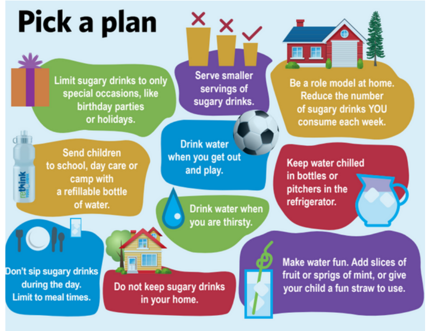
How can I reduce my sugar intake?

According to the Centers for Disease Control and Prevention (CDC), sugary drinks are the leading source of added sugar in the American diet. Many of these liquids are commonly purchased regularly: soda, fruit drinks, sports drinks, energy drinks, and sugar-sweetened waters and teas. Regular consumption of these drinks can lead to health problems, including weight gain, type 2 diabetes, obesity, heart disease, and cavities.